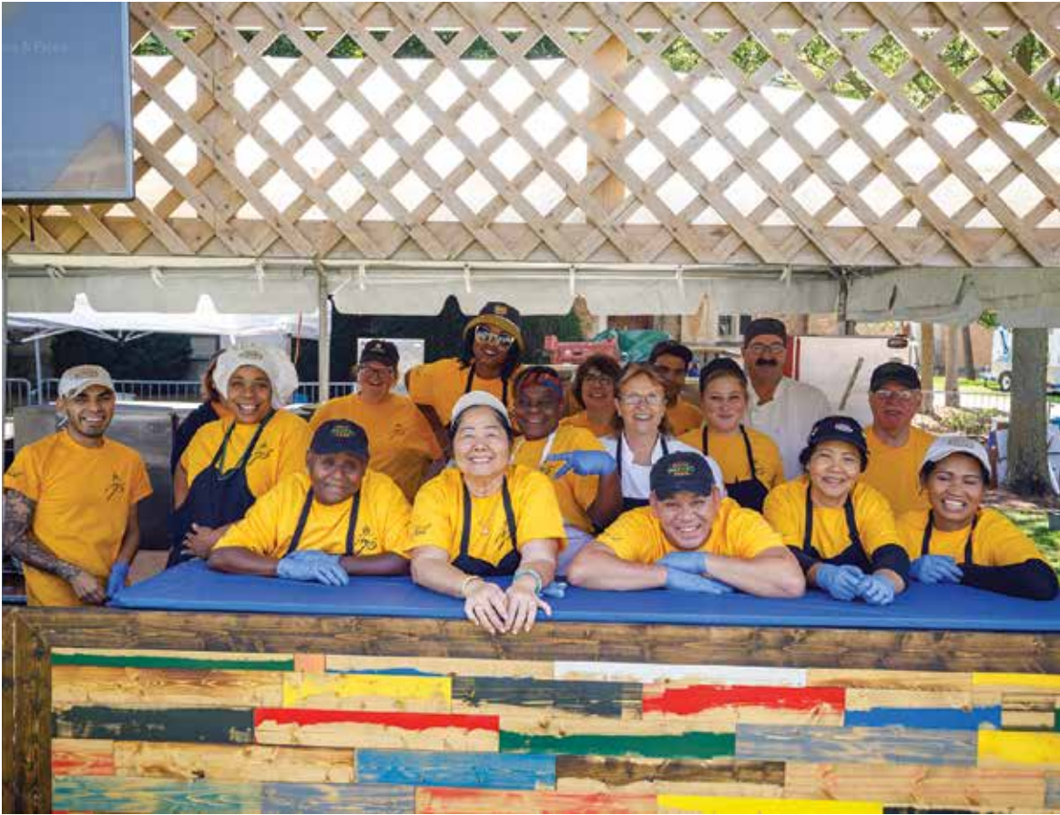
Employees smile for a photo at the academic year opening picnic.

The past year’s awards also helped Notre Dame expand its global footprint, with 145 awards, totaling $93 million, supporting research in 61 different countries.